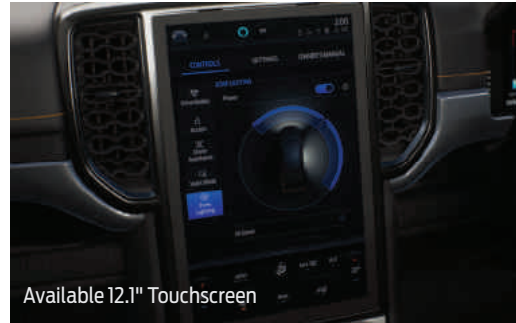
Available 12.1" Touchscreen