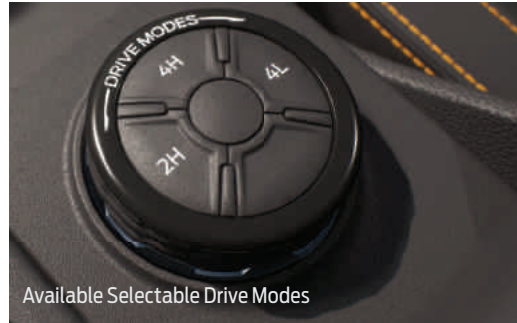
Available Selectable Drive Modes

Take voice-activated SYNC® 4 1 with wireless Apple CarPlay® and Android Auto™ compatibility. 2 Navigate and control your apps on the available 10.1" or 12.1" touchscreen 1 or by using simple voice commands. This large integrated touchscreen puts control at your fingertips, while a new digital instrument cluster lets you customize the information you want to see. The available Selectable Drive Modes work effortlessly for on-the-fly confidence over all terrains. Plus, the available Dual-Zone Climate Control separates cabin temps for driver and front passenger, while available wireless charging 3 allows you to charge your compatible smartphone without using a cable.