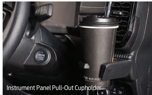
Instrument Panel Pull-Out Cupholder