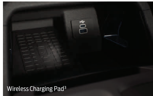
Wireless Charging Pad 3